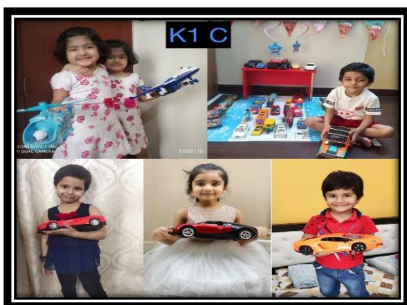
GRADE-K1 VEHICLE PARADE

The students of K1 participated in the Vehicle Parade, an activity of the ongoing theme 'Cars'. The students were handmade head gears of various types of transportation and spoke about them. Few students also showed their favourite toy car and spoke about its special features. They were excited to show their favourite vehicle to each other. Trains with engine, rockets, fire trucks, boats with colourful sails, cars with giant wheels and airplanes all the vehicles were unique and exceptional. They showed the traffic lights and also spoke about the importance of wearing a seatbelt. It was a day full of learning and excitement for the students.