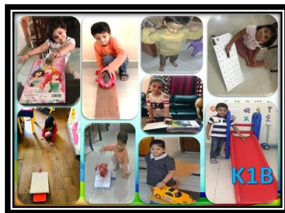
GRADE-K1 EXPERIMENT-INCLINED PLANE

Then the students were guided to measure the distance covered by their toy cars using hand/ foot span as a tool of measurement. This activity was planned under the ongoing theme 'Cars' on October 16th, 2020 and was thoroughly enjoyed by all the students.