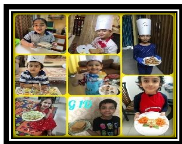
GRADE-1 INSPIRING YOUR INNER CHEF

'Inspiring your Inner Chef' was a fireless cooking activity organised for students of Grade 1 on 16th October 2020. Cooking is an essential life skill. It encourages children to be self-directed and also helps them to develop confidence, creativity, problem solving skills and independence. Keeping this in mind the students were asked to don their chef caps to cook and present a dish during the class.