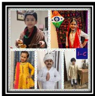
GRADE-1 CONNECTING TO THE ROOTS

The students of Grade 1 participated in the activity 'Connecting to the Roots' on 22nd January, 2021 with full enthusiasm and zeal. The activity was aimed at showcasing the diversity of culture, heritage, religion, language and cuisines of various states of India. The students were facilitated to express their thoughts and ideas about our rich culture through a dance, song or speech. Students donned their traditional attire and danced on folk music, sang melodious songs in different languages and spoke about their culture in their regional dialect. Our young stars showcased their talent with a lot of pride and confidence. This activity truly depicted the idea of 'Unity in Diversity' in our country and made us all feel proud.