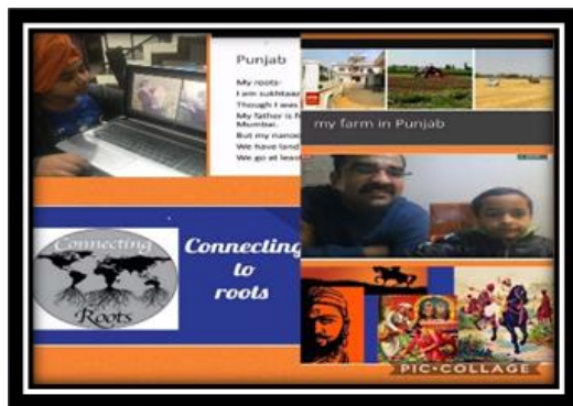
GRADE-3 CONNECTING TO ROOTS

Students of Grade 3 presented an activity wherein varied Indian traditions and culture from different parts of India were highlighted. The students excitedly paired up with their parents as one of the easiest ways to learn more about your heritage is by simply talking with your relatives. Grandparents, great-grandparents, aunts, uncles and others who originally hail from other parts of the world can offer a wealth of information about their native country and send you down the right path toward learning more about your family's history. The main objective of the activity was to be accustomed and be proud of the things that we have inherited from our ancestors and hence take the legacy forward in the best way we can.