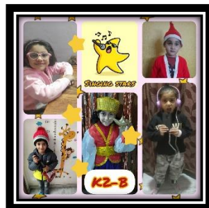
GRADE-K2 VIRTUAL IDOL

Music binds our soul, hearts and emotions. Music is the best method of relaxation. It cheers the spirit and lightens the heart. In fact through singing children learn to express their feelings and ideas. To bring out the singing talent of our students K2 organised an activity called Virtual Idol. Students sang any Hindi/English songs even with musical instruments. They really enjoyed this activity as the children sang the songs with a lot of passion and confidence. They also showcased a sense of pride, self-esteem and self-confidence as a result of this activity.