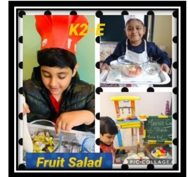
GRADE-K2 MASTER CHEF