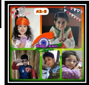
GRADE-K2 BAL KAVI