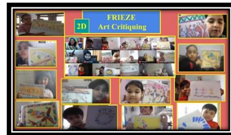
GRADE-2 ART CRITIQUING