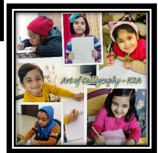
GRADE-K2 ART OF CALLIGRAPHY