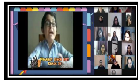
GRADE-3 REVISITING CURRICULUM