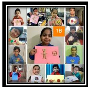
GRADE-1 FANTASTIC FRACTIONS

Proficiency with fractions is an important foundation for learning more advanced mathematics and what could be better than to integrate it with activities which makes learning fun, engaging and effective. Keeping this in mind, Grade 1 conducted an activity 'Fantastic Fractions' on 29th January 2021. The students used play dough to demonstrate their Fraction skills and created beautiful masterpieces with dough after showing fractions. This helped students strengthen their motor skills, problem solving and reasoning skills. The activity culminated with Fraction Boogie Dance which was enjoyed by one and all!