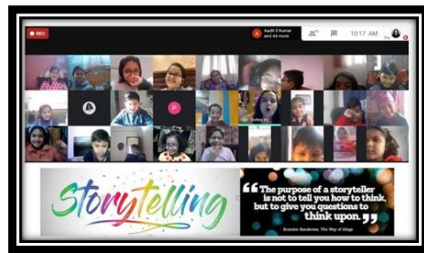
GRADE-1-3 STORY TELLING

Students of Grade 3 enthusiastically put on their creative caps and confidently presented their distinctive ideas in form of a small model which they designed and called 'My Wonder Vehicle'. Recently our little learners learnt about the invention of wheel and its significant impact on our daily life. Thus, learning about the advent of the wheel, a new spirit of exploration and joy inspired the students to design their own dream vehicles using their unique ideas and keeping in mind its utility and sustainability in the future. The students diligently worked on the project to give shape to their imagination. They designed a 3D model with wheels keeping in mind the futuristic approach of how they would want their future vehicles to be and discussed about its features, comfortability, safety, sustainability and fuel type. Needless to say, their innovation and creativity knew no bounds. Hopefully these tiny steps towards creative and innovative thinking will inspire our little inventors to explore, evolve and make great inventions in the times to come.